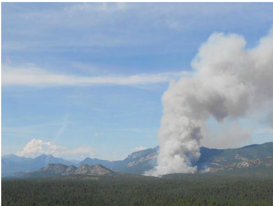
Island Pond Wildfire (near Canal Flats) 2017 RDEK File Photo